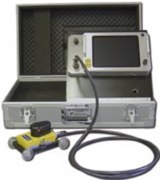
Figure 1. The system includes a field rugged all metal controller and high impact glass monitor.

Features include the ability to rapidly scan areas for 2D locating and to mark targets or collect data on a grid mat supplied with the system, for "in the box" 3D imaging in the field for instantaneou results.